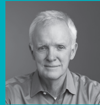
Bob Kerrey Former U.S. Senator and Governor