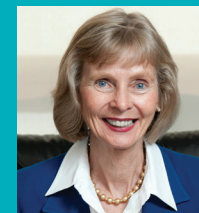
Lois Capps Former U.S. Representative