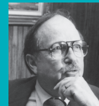
Lou Cannon Journalist, author, biographer