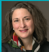
Phoebe Stein President Federation of State Humanities Councils