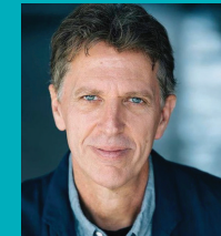
Tim Kring Screenwriter/ Showrunner