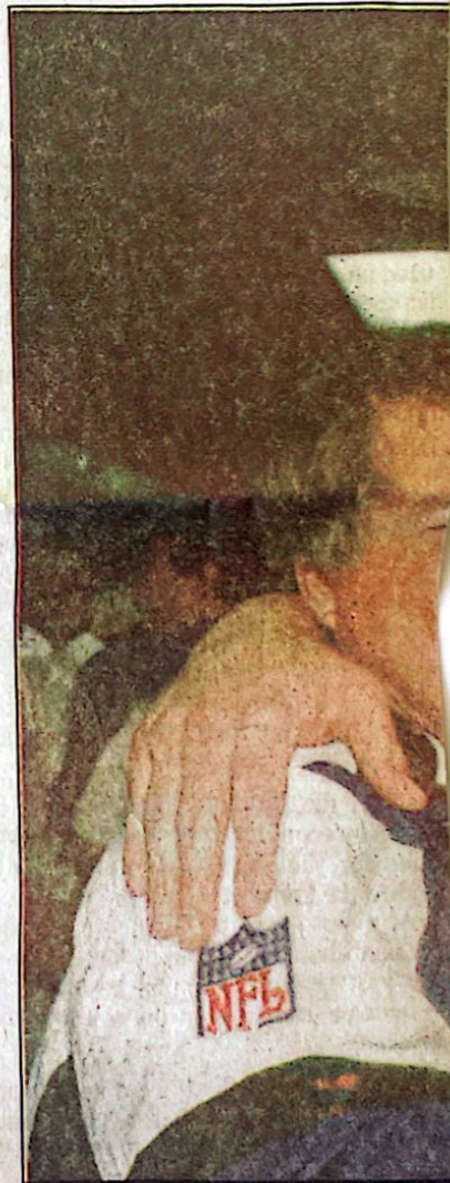
Dallas Coach Jimmy Johnson celebrates the Buffalo Bills' 30-13 Super Bowl defeat. It was the Cowboys'...